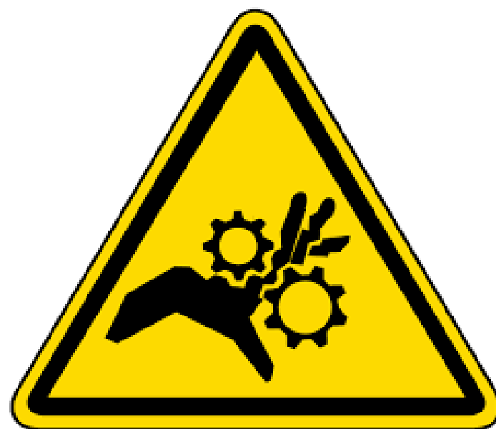
Mill (motor) 15x15cm